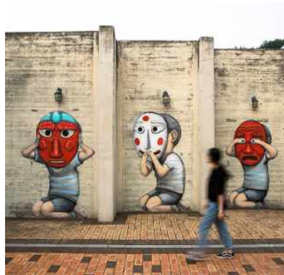
Université de Chosun, Corée, 2019