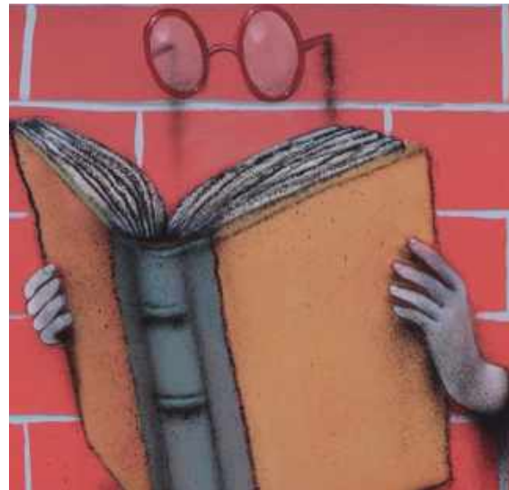
"Le passe muraille", Marché des Batignolles, France, 2019