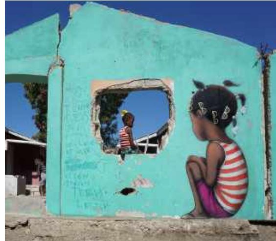
"Made in Haiti", Haiti, 2019