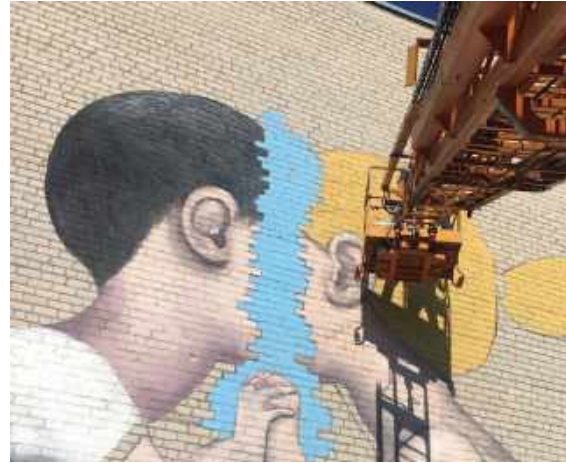
"Popasna", Ukraine, 2019