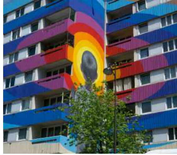
Boulevard Paris 13, France, 2019