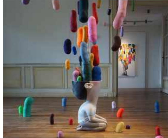
Institut culturel Bernard Magrez, France, 2019