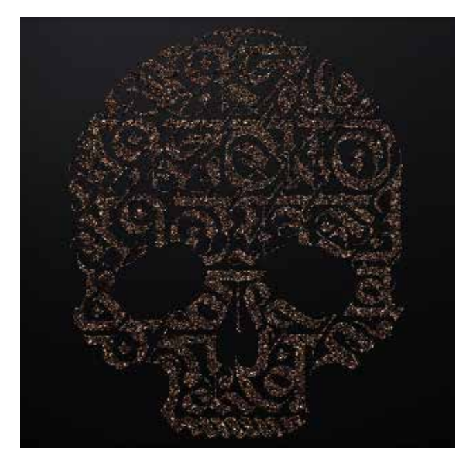
MOMENTO MORI SKULL

Acrylique et éléments végétaux séchés sur toile 2019