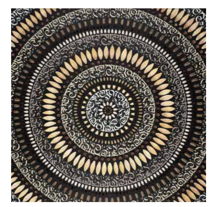
THE NATURAL LAW

Acrylique et éléments végétaux séchés sur toile 2019