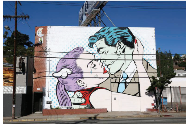
Los Angeles 2017