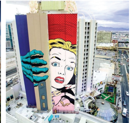
Las Vegas, 2017