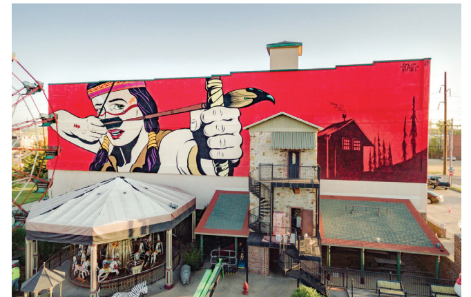
Fort Smith, 2016