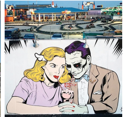
Coney Island, 2016