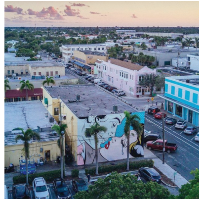
Lake Worth, 2017