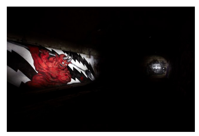
2011 The Underbelly Project in Paris