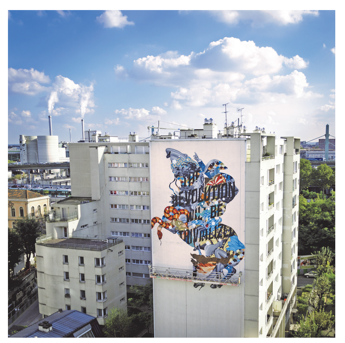
2014 «The Revolution will be trivialized» for Nuit Blanche in Paris