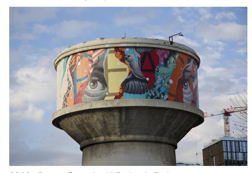
2016 «Peace» Street Art 13 Project in Paris